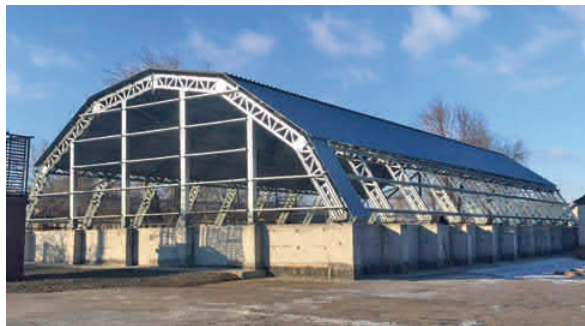
A granary 15mx30m in Dnipropetrovsk region