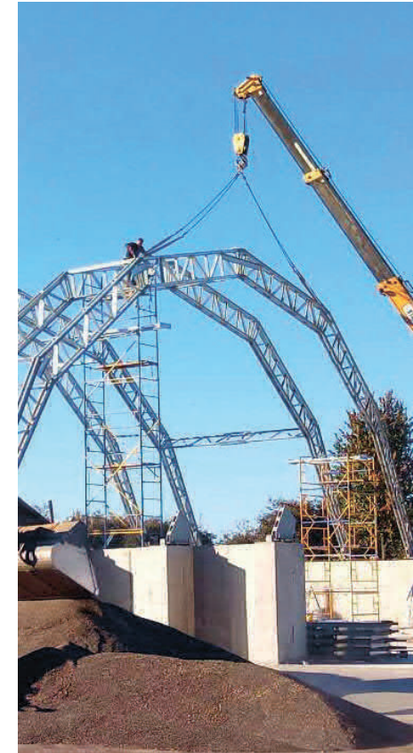
A granary 24mx24m in Chernihiv region