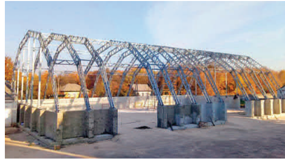
A granary 24mx42m in Chernihiv region