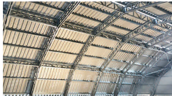
A granary 15mx30m in Dnipropetrovsk region