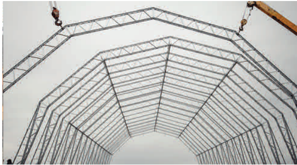
A granary 24mx64m in Rivne region